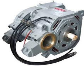
Figure 1. Motor Traction

electric motor used as a traction motor due to its high starting torque characteristics. However, due to the need for intensive maintenance, the traction motor shifts using an AC motor which is easier to maintain and easier to control.